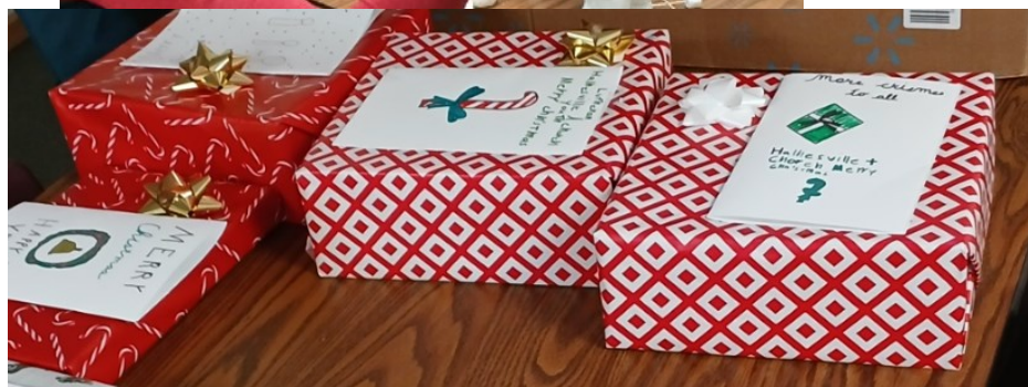
Gifts made by the youth as a service project for giving to shut-ins.